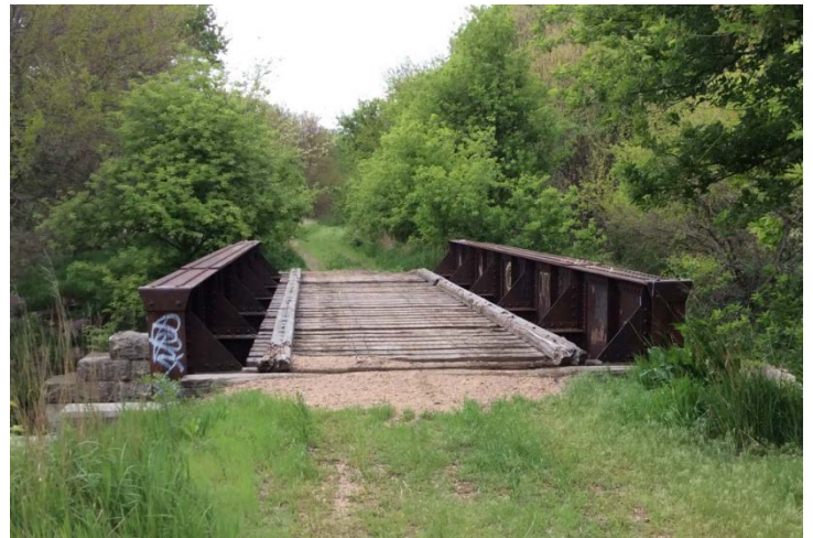
Steel girder bridge over Hell Creek

Project design will be completed in summer 2017, with construction bidding expected in fall, and construction during the spring and summer of 2018. Neighborhood connections will be included to provide access points along the length of the trail.