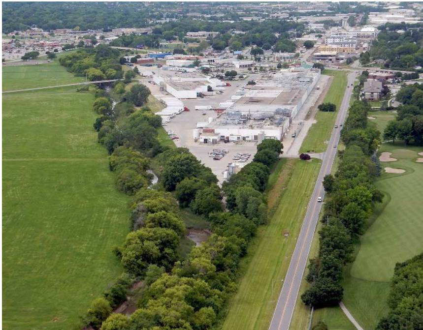
Looking northwest along Harry Andersen Ave.