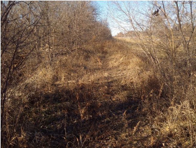
Existing tree canopy along rail corridor

The corridor is the original location of the Transcontinental Railroad from Union Pacific, historic aspects are being preserved and upgraded for trail use.