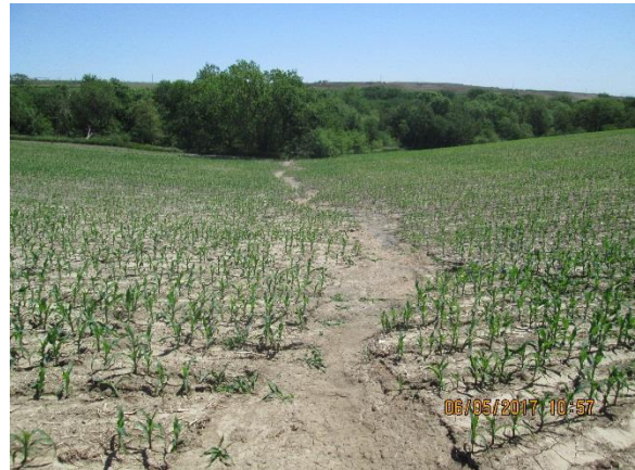
Ephemeral Erosion - heavy rains