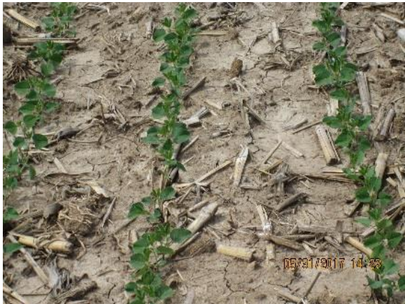
Soybeans planted into corn residue

Field reviews are mostly completed. In addition to checking residue levels, staff are also looking for erosion where concentrated flows exist.