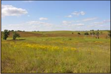
Viewing north across the lowland at Glacier Creek Preserve.

Glacier Creek Project Fund Raising: $6.25 million are needed to purchase the 205 acre North Conservation Area, which consists of the combined West Watershed and North Tracts (see map). Of this, we have $2.8 million in hand leaving $3.4 million to complete the purchase. Investment in the overall project to date totals $4.5 million. The price and availability of the land are only guaranteed until August 2015 thus there is an urgency to this one-time purchase. Donations to the tax exempt (501c3) organization would be available for tax benefits. See contact information below.