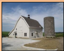
The Barn @ Glacier Creek education and research facility