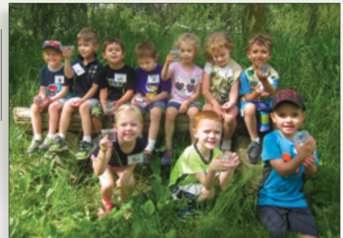
Backyard Explorers Summer Campers with viewing jars display their finds.