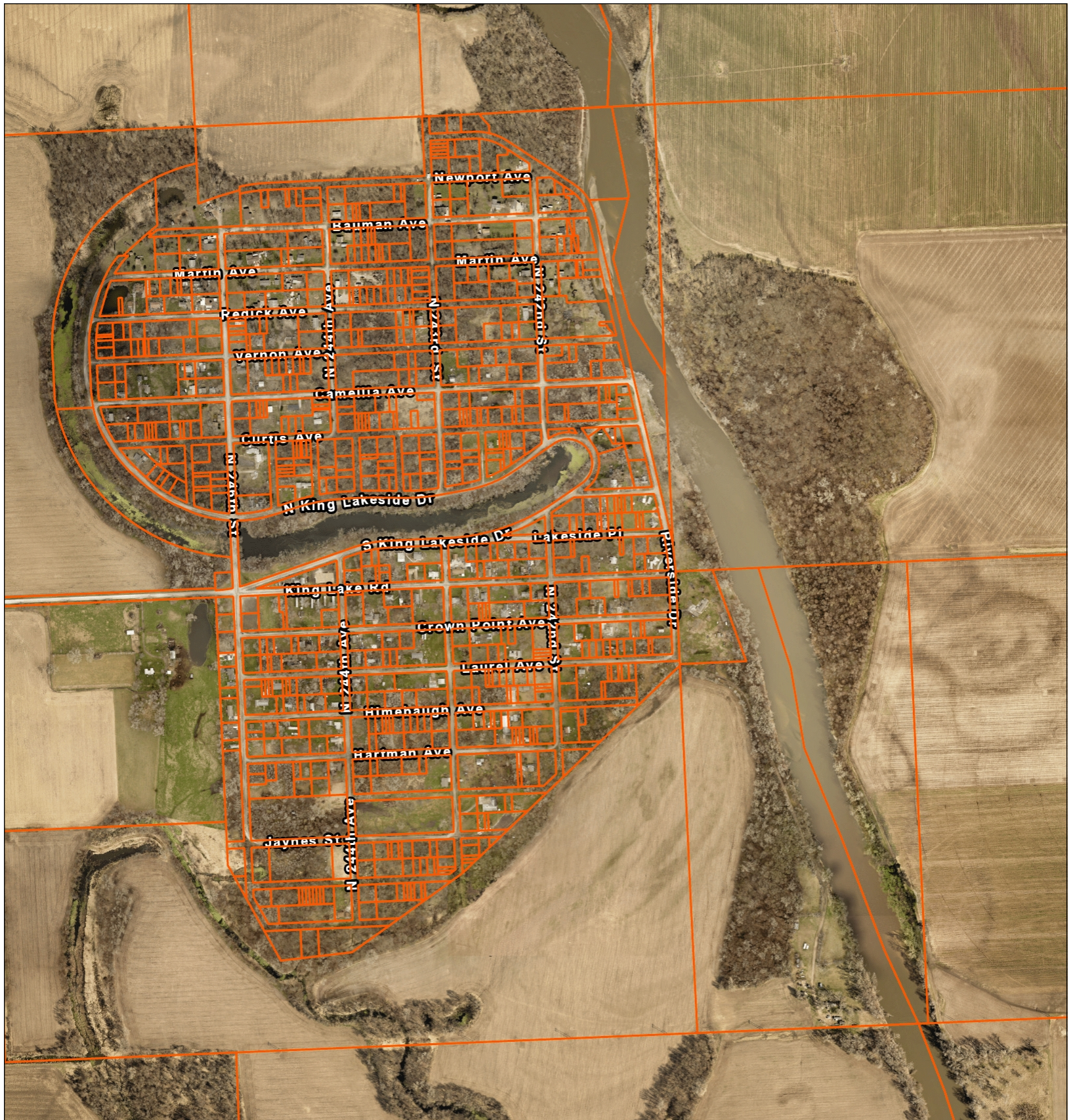
Exhibit 4 - King Lake ENCAP Property