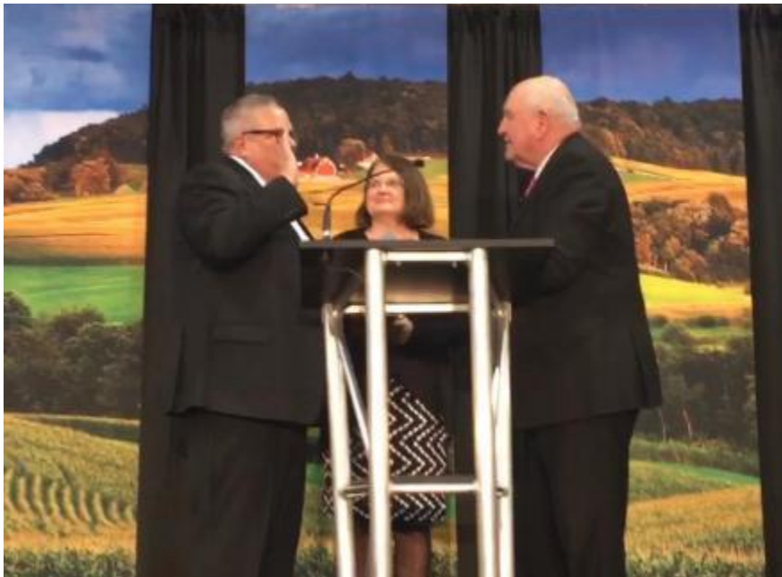
U.S. Secretary of Agriculture Sonny Perdue administers the oath of office to Under Secretary for Farm and Foreign Agricultural Service Bill Northey.

U.S. Secretary of Agriculture Sonny Perdue administered the oath of office to Bill Northey at the Annual Iowa Ag Leaders Dinner on March 6. Until then, Northey had served as Iowa's Secretary of Agriculture, a position he had held for more than eleven years. Northey will serve as the Under Secretary for Farm and Foreign Agricultural Service (FFAS)* at the U.S. Department of Agriculture (USDA).