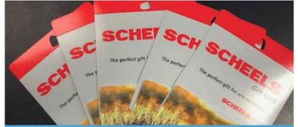
5 $100 Scheels gift certificates