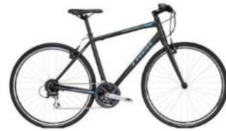
2018 TREK FX 2 Hybrid Bicycle Available from the Bike Rack. Winner can select men or women's bike.