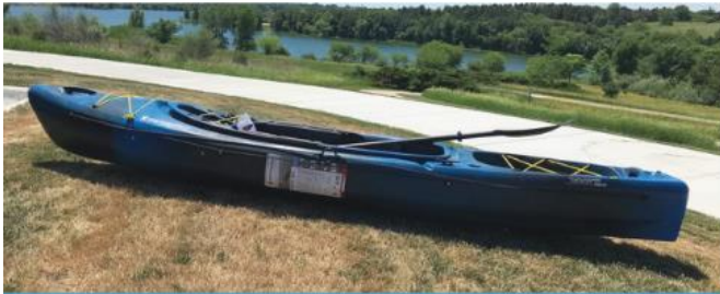
Perception Hook 105 Angler Kayak