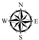
Culvert Location Map