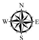
Culvert Location Map