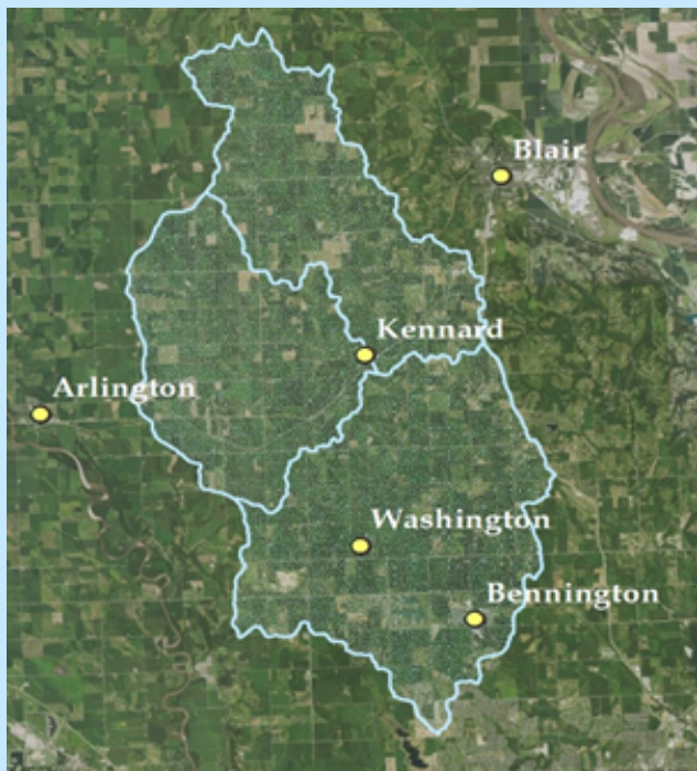
The Papillion Creek Watershed encompasses parts of Washington and Douglas County.