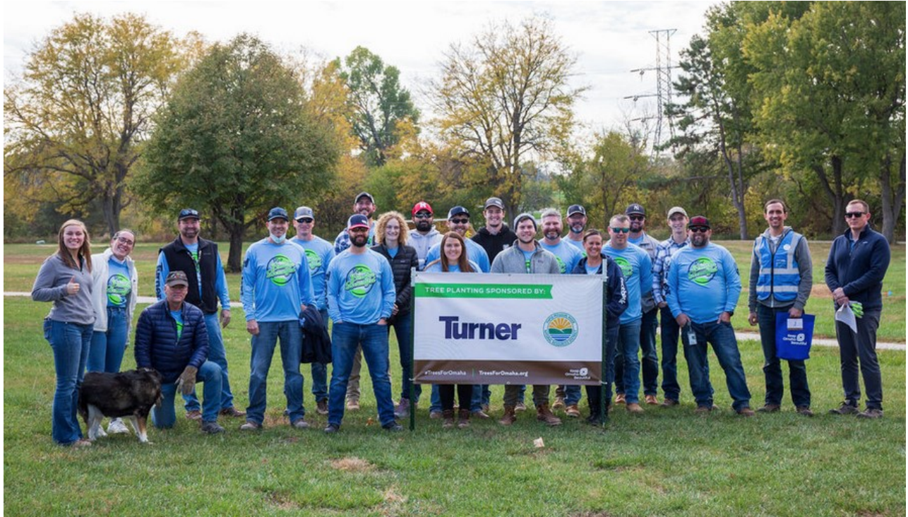
Papio NRD & Turner Construction Co-sponsored Keep Omaha Beautiful Tree Planting Event