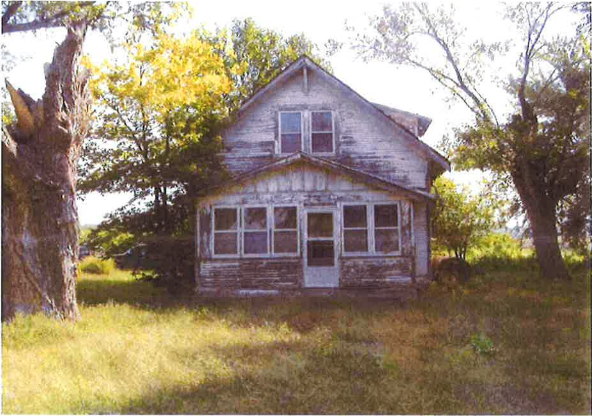
Figure 3. WEST SIDE OF THE STRUCTURE ON THE PROPERTY.