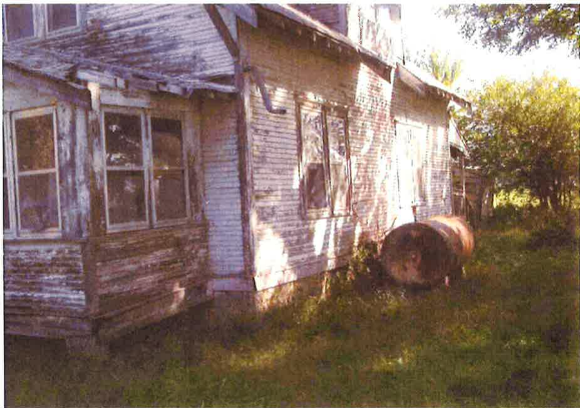
Figure 2. SOUTH SIDE OF THE STRUCTURE ON THE PROPERTY.