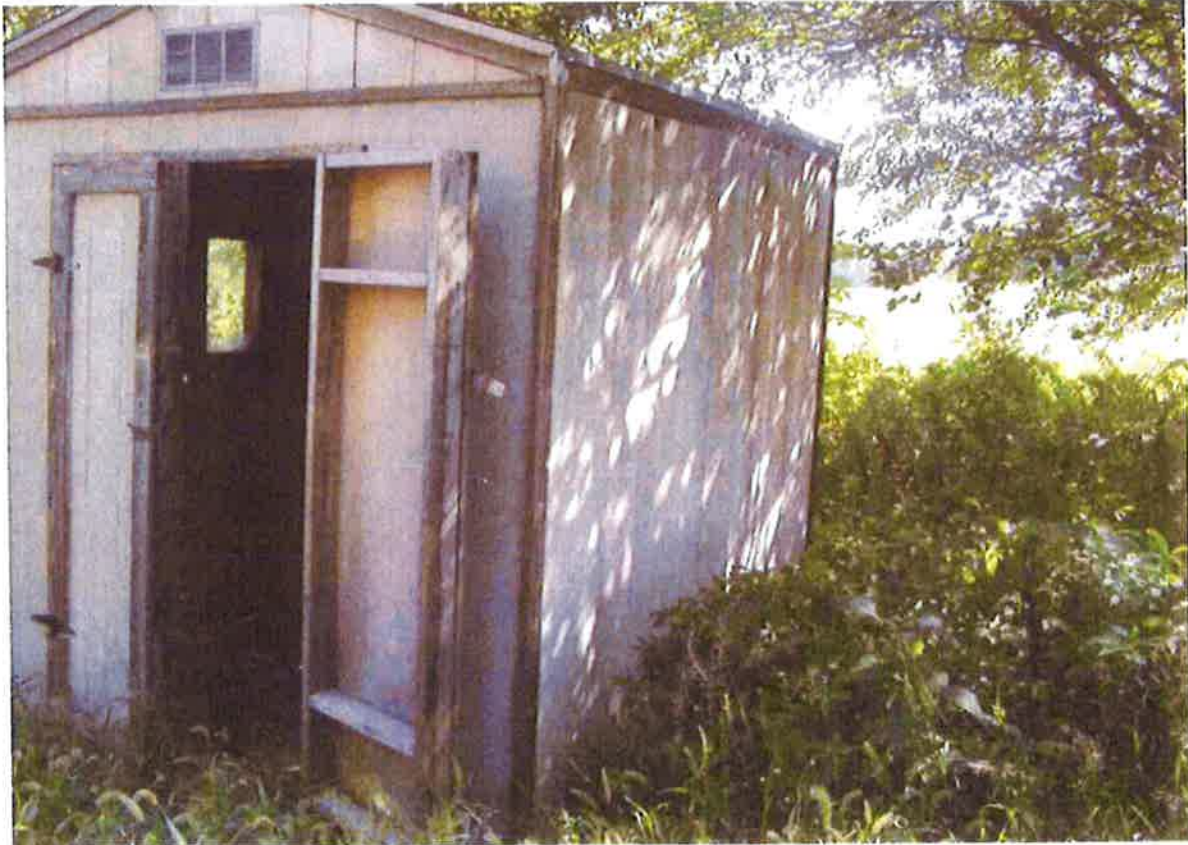
Figure 6. SMALL SHED ON THE PROPERTY.