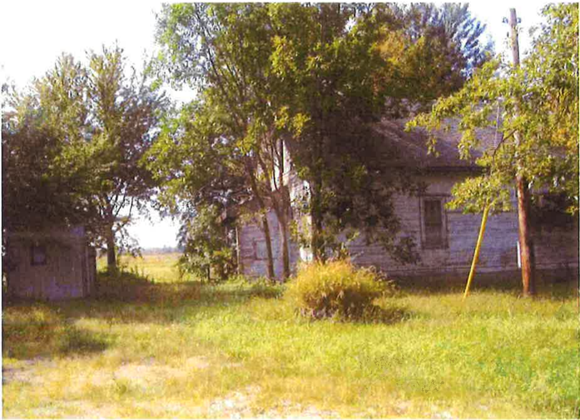
Figure 1. VIEW ACROSS THE PROPERTY FROM NORTH TO SOUTH.