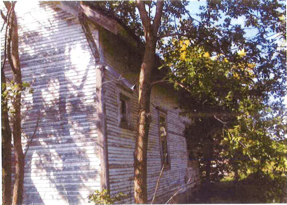
Figure 5. NORTH SIDE OF THE STRUCTURE ON THE PROPERTY.