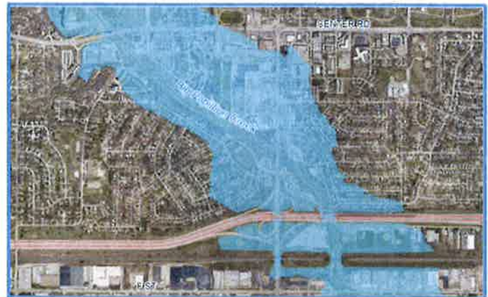
Inundation areas on Big Papillion Creek near 84th & I-80