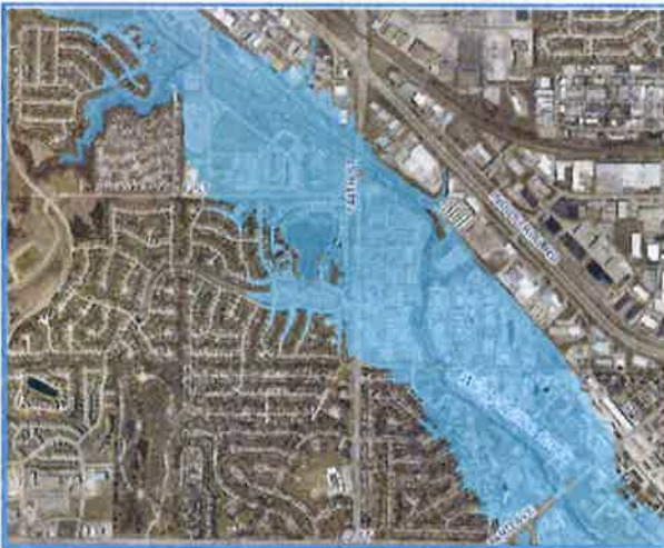
Inundation areas on West Papillion Creek near 144th & F Sts