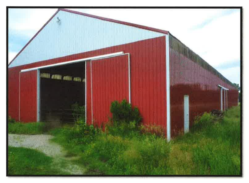
Building 2 – Arena