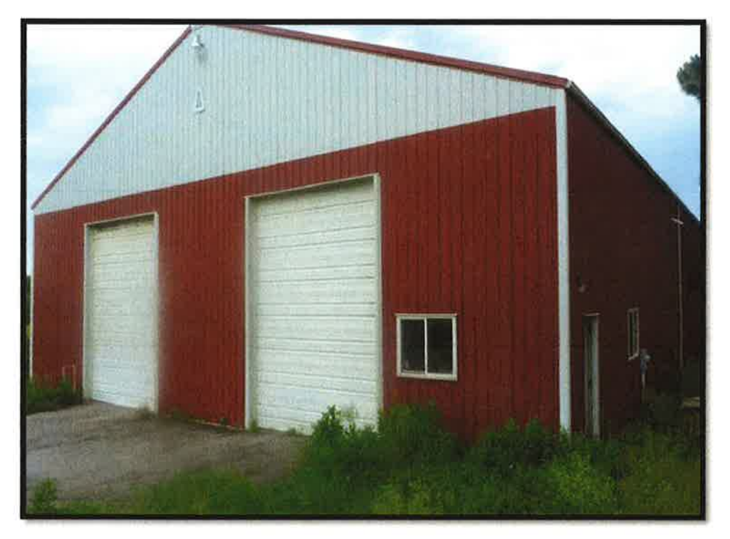
Building 4 – Stable & Equipment Shelter