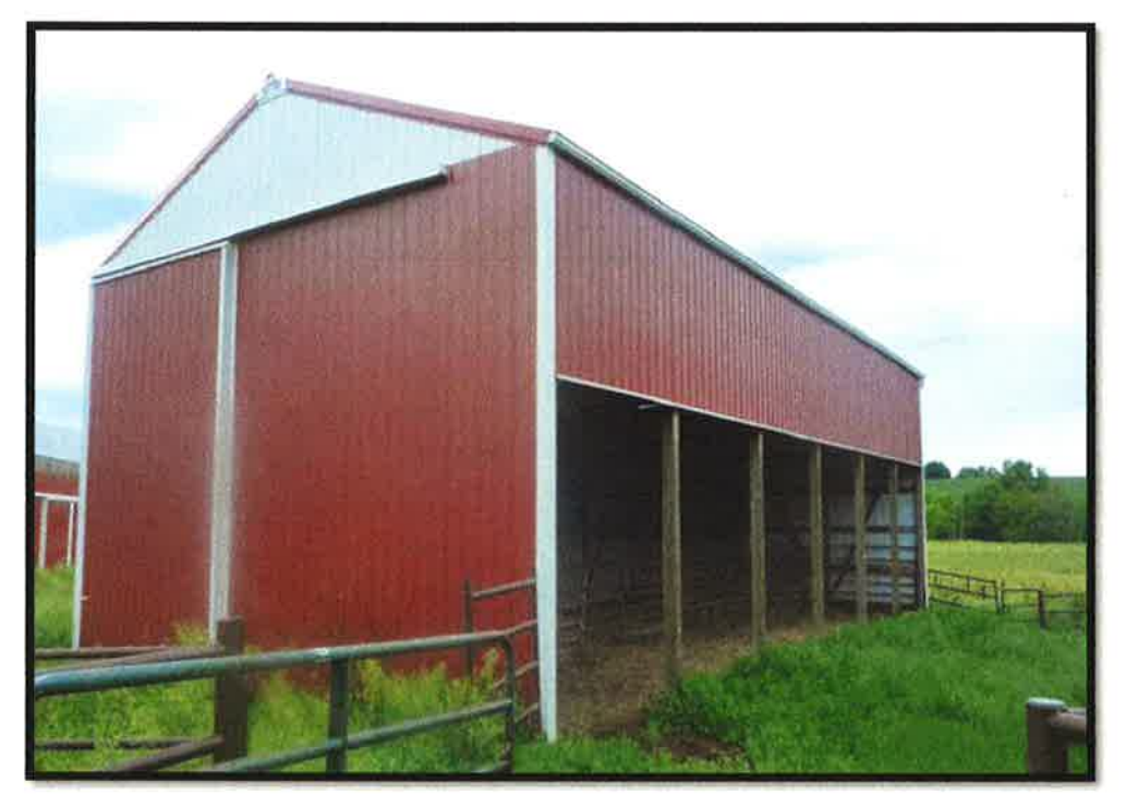
Building 3 – Storage Shelter