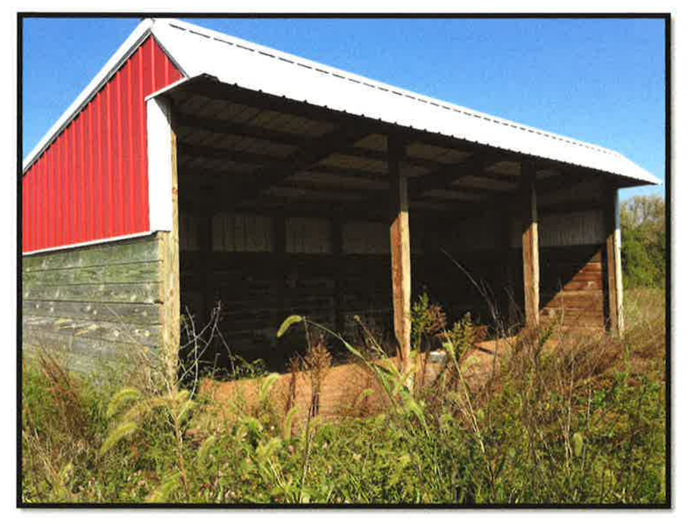
Building 5 – Animal Shelter