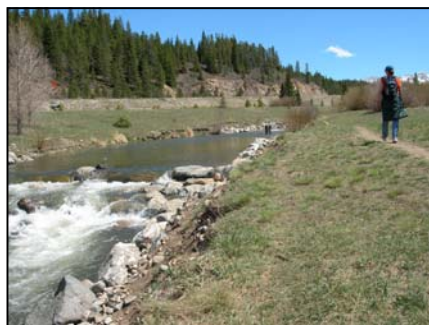
Restored Section of Blue River Through Former Mining Area