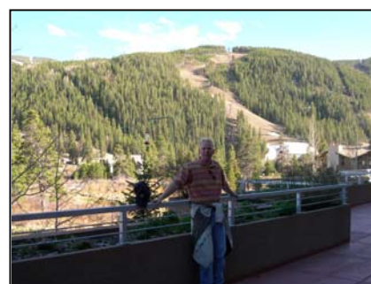
Keystone Ski Slopes in Background

I chose a variety of sessions to attend rather than sticking to just one track as I did last year when I was certified in watershed assessment by the Center for Watershed Protection. I attended the following sessions: SATURDAY - Creating Less Stupid Growth, Hybrid & Quasi-Governmental Watershed Groups, and Grant-writing for the Small Shop; SUNDAY - Funders Forum Panel, Field Trip to see several restoration projects on the Blue River; MONDAY - How to Ask for a Major Gift and Preventing the Impacts of New Development. I departed 5:15 a.m. on Tuesday. Although the area was so beautiful, I was happy to return to a lower altitude since Keystone is at 9,000 feet above sea level. Several speakers and many participants were literally breathless from the thinner air. After a few days, I was finally getting used to it and then it was time to return.