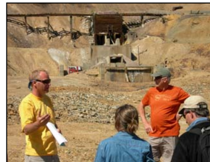
Discussing Water Clean-up at Former Wellington Mine - Site of largest gold nugget found in US