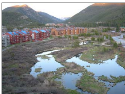
Keystone Resort - My view every morning

River Rally 2005 I recently attended the 2005 River Network's River Rally in Keystone Colorado from May 20 - 24, 2005. Yes, what an awful location for a conference with the backdrop of snowcapped mountains, fresh mountain air, beautiful streams, abundant wildlife, and 70 degree weather. This is the second time I have attended this rally and again it was full of interesting presentations, fundraising seminars, topical issues (some controversial), camaraderie, and a genuine opportunity for me as a river manager to mingle and exchange ideas and stories with others in my field. On Sunday of the conference, we had the opportunity to take a field trip and see firsthand some watershed restoration projects.